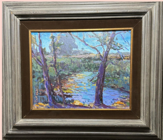
Vince Walsh, The Secret Spot, featured at Expressions Curated Art Show