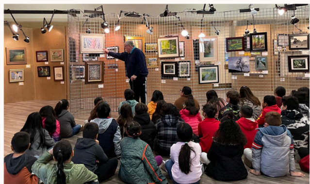
Teaching visiting students about watercolor painting at Expressions Art Show