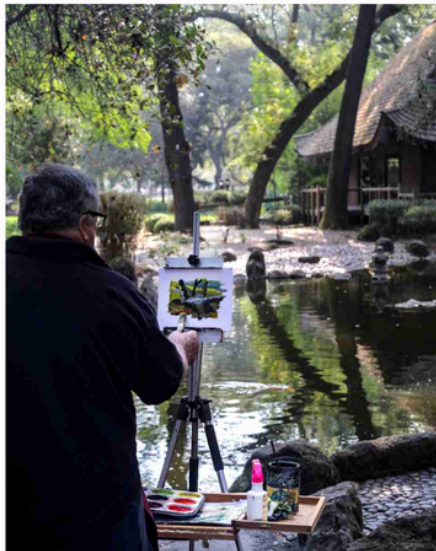
Plein Air Painting